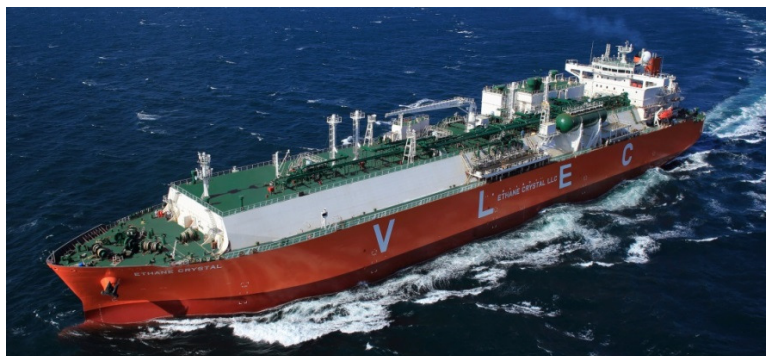
Very Large Ethane Carrier the ETHANE CRYSTAL

MOL utilized its experience, know how, and network built over the years as one of the largest LNG carrier owners and operators and, significant experience as owners and operators of LPG carriers in order to obtain this business. MOL's experience in LNG / LPG segments and its unmatched service, safety, reliability and efficiency precisely met the stringent requirements of Reliance prior being appointed as a suitable shipping partner for Ethane Transportation Project.