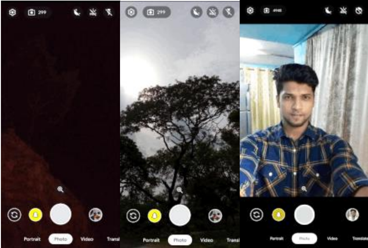
Image 1: Clearer photos in low light with Night mode; Image 2: Photos have wider dynamic range with HDR mode; Image 3: Snapchat Lenses bring Indian-specific effects to your selfies

A great camera: A fast, high-quality camera is a must-have feature for today's smartphone users, so Google and Jio's teams have partnered closely to build an optimized experience within the phone's Camera module resulting in great photos and videos: from clearer photos at night and in low-light situations to HDR mode that brings out wider color and dynamic range in photos, these are firsts for affordable phones in India. Google has also partnered with Snap to integrate Indian-specific Snapchat Lenses directly into the phone's camera, and we will continue to update this experience.